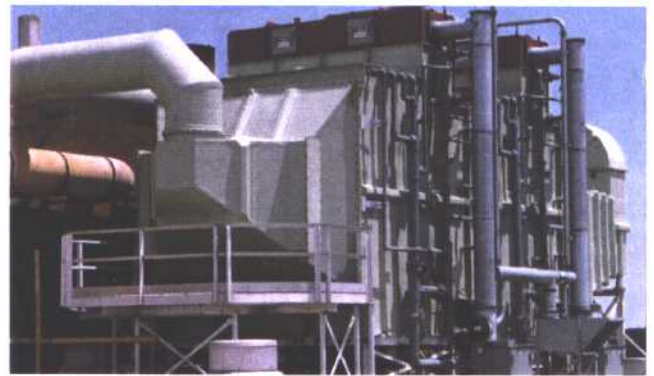
Ionizing Wet Scrubber (IWS®)