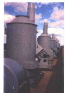
Vertical packed tower scrubbers